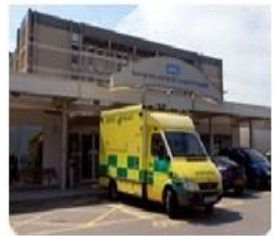
Andover War Memorial Hospital